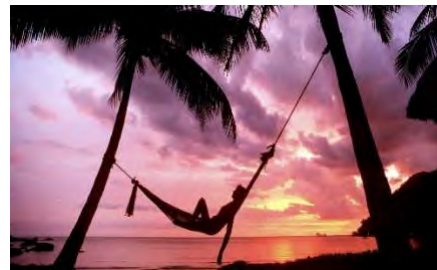
YOU (After SCS horse-sitting)