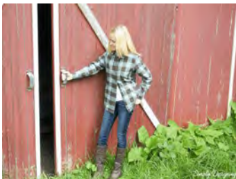
YOU (Before SCS horse-sitting)

But what about the horses? We're on it! We feed, groom, and more! Plus, we come to you! Absolutely NO transporting necessary! We have a limited amount of horse-sitters, so call now! (606) SCS-0936