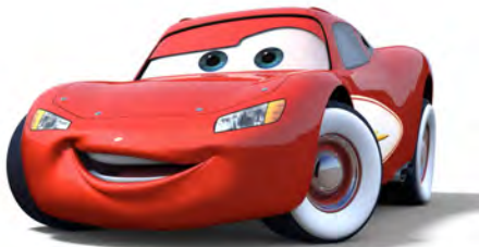
Country Whitewall Lightning McQueen ↑