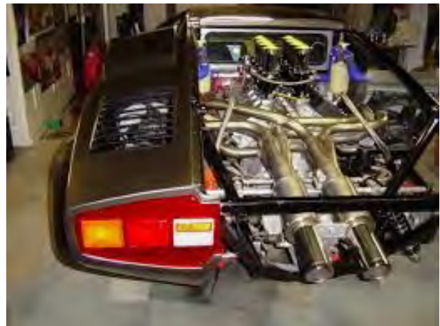
Interior of the Lamborghini Countach