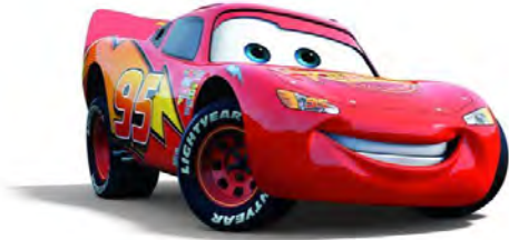
Original Lightning McQueen ↑

something better than winning. He finds friendship and happiness even after losing.