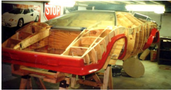
The Wooden Frame