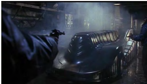
-The Batmobile in its cocoon

The Batmobile is truly the coolest car. There are two layers of armour plating, called the “Cocoon”, that can be deployed when parked. Also rear oil dispensers, then an exhaust afterburner, side mounting grappling hook and projectile launchers, launcher disc, and side chassis with mounted shin breakers. Another cool feature is a foot under the car that can lift the batmobile and turn in 180 degrees, on the front of the car 2 M1919.30 caliber machine gun. The coolest feature is the Batmissile, where the car can turn into an inclosed motorcycle.