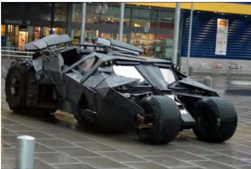
-Dark Knight Trilogy

However, the Dark Knight Trilogy batmobile is known for its very sharp cubic lines.